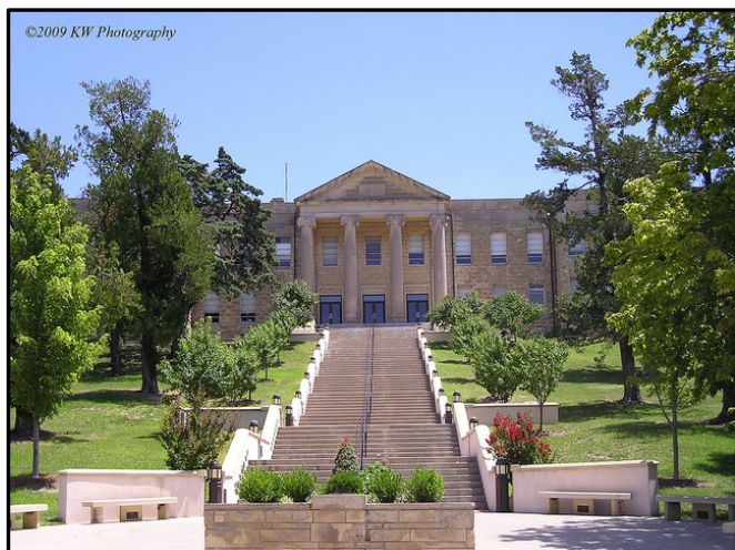
*Southwestern College Residential Campus Winfield, KS

Southwestern is a learning community of approximately 1,800 learners, 50 full-time teaching faculty members, and 270 affiliate faculty members from leading industries across the country. In addition to programs for traditional age learners and working adults, the College provides learning opportunities for service men and women in all branches of the military.