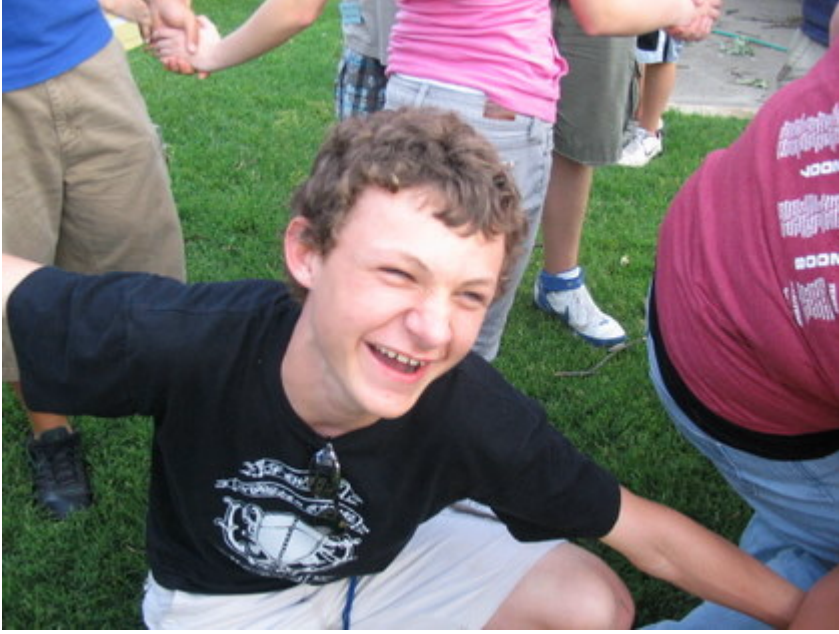
Oh No! They made a bow and I'm the knot!