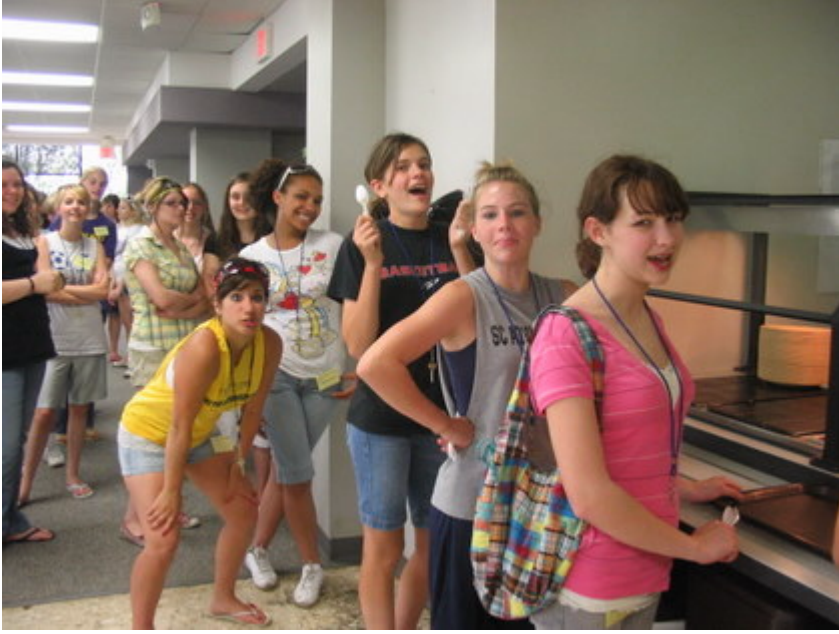
Getting to know you while waiting in line to eat.