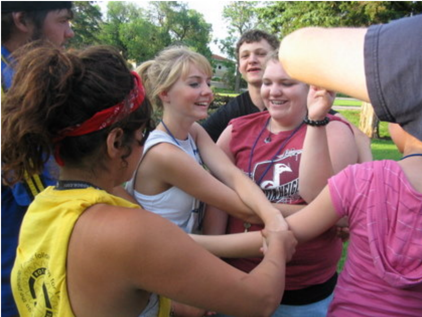
We're making progress.