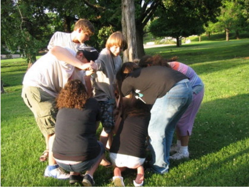
Human Knot. Can we undo it?