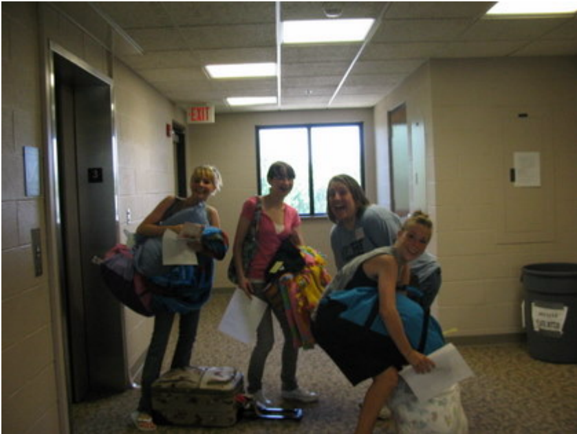
Too Much Stuff!!