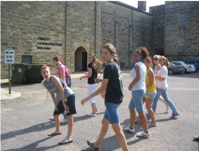
We've said goodbye. Now we are on our way to supper.