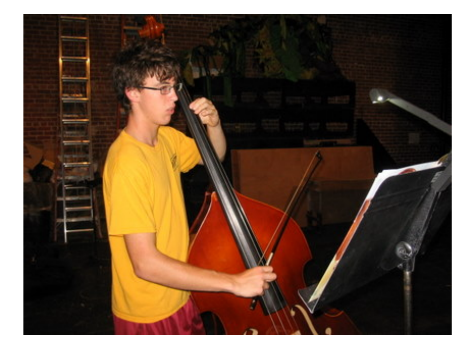
Dedication in the afternoon rehearsal.