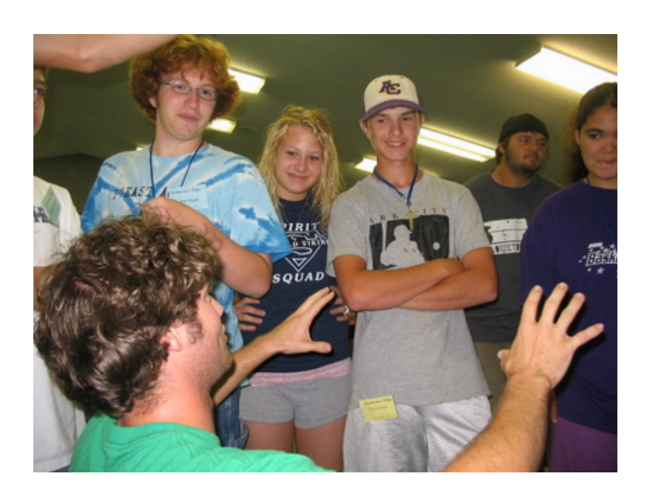
"Here's the plan."