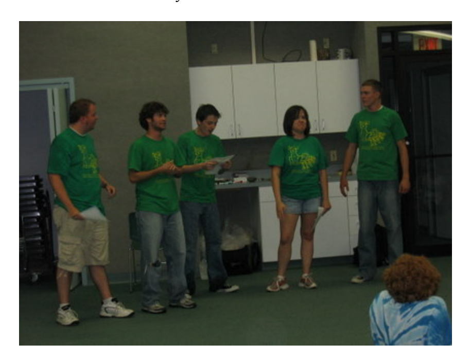
9-Lives Comedy Improv Troup! What a BLAST!