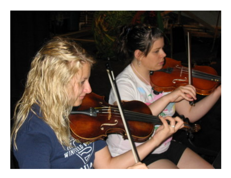
Who knew a storm was brewing? We know right where to go for safety!