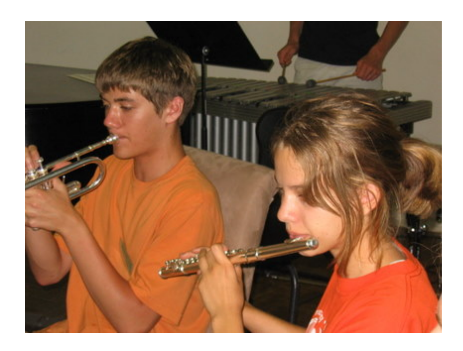
Jazz Flute! Cool!