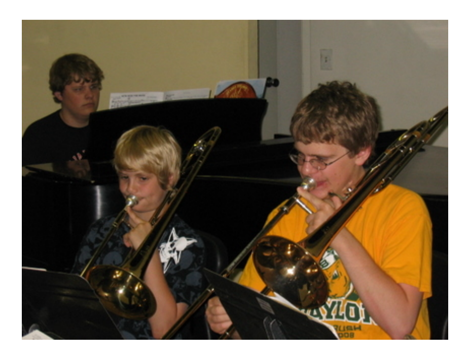
Working together for that perfect jazz sound.