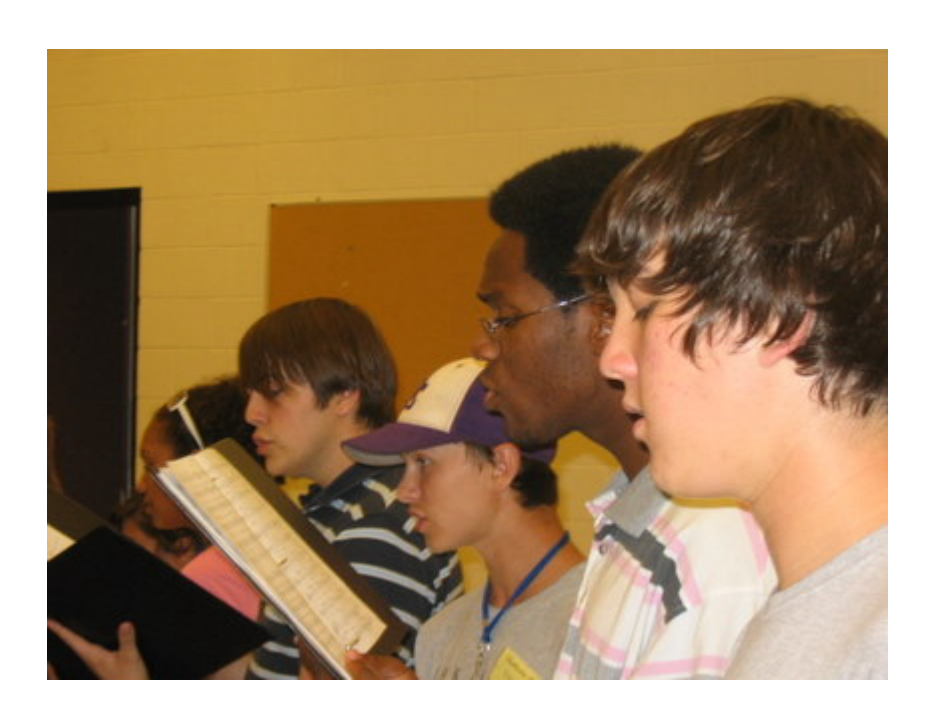
Singing with INTENT!