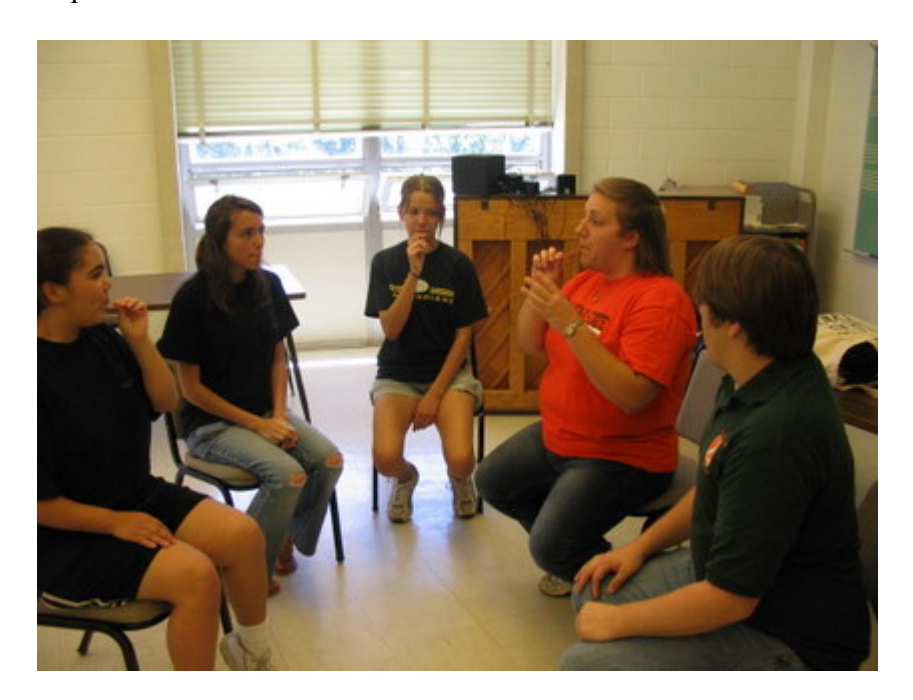
Flute Masterclass - Breath Control, Flautists have to have it!! No better way to understand and develop it than through an itty bitty straw.