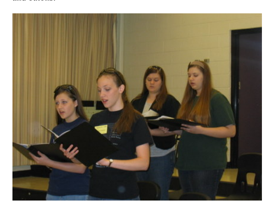
Elective - Conducting - We have a live choir on whom we can practice our conducting!