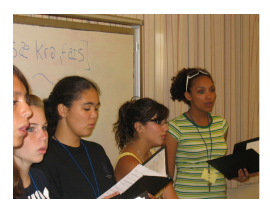
Singing in a circle to hear one another.