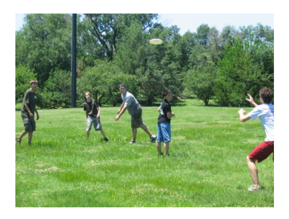
Break from rehearsal - Ultimate Frisbee