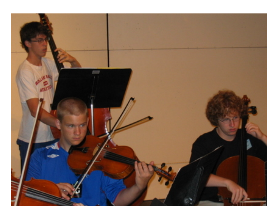
Ultimate Frisbee, shower and change - now back to making music.