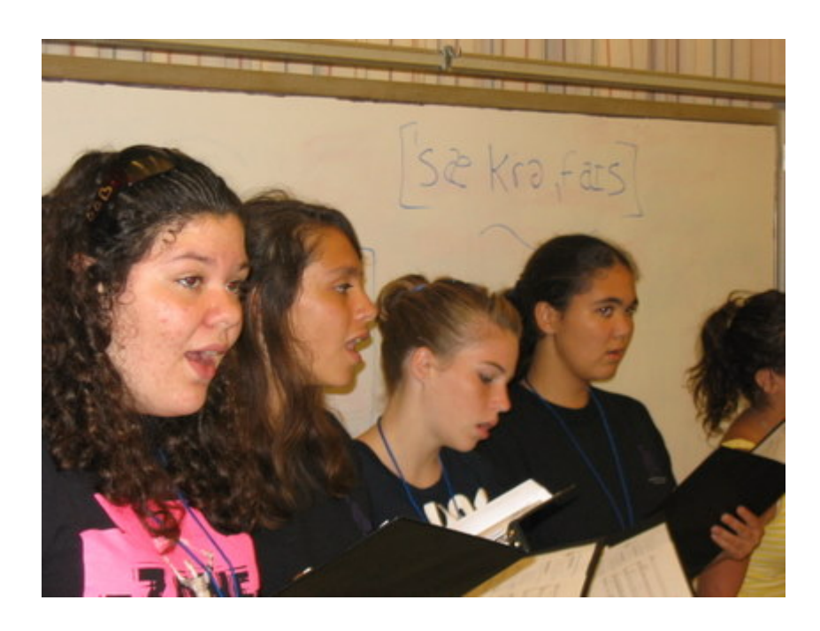
IPA symbols to guide toward correct pronunciation.