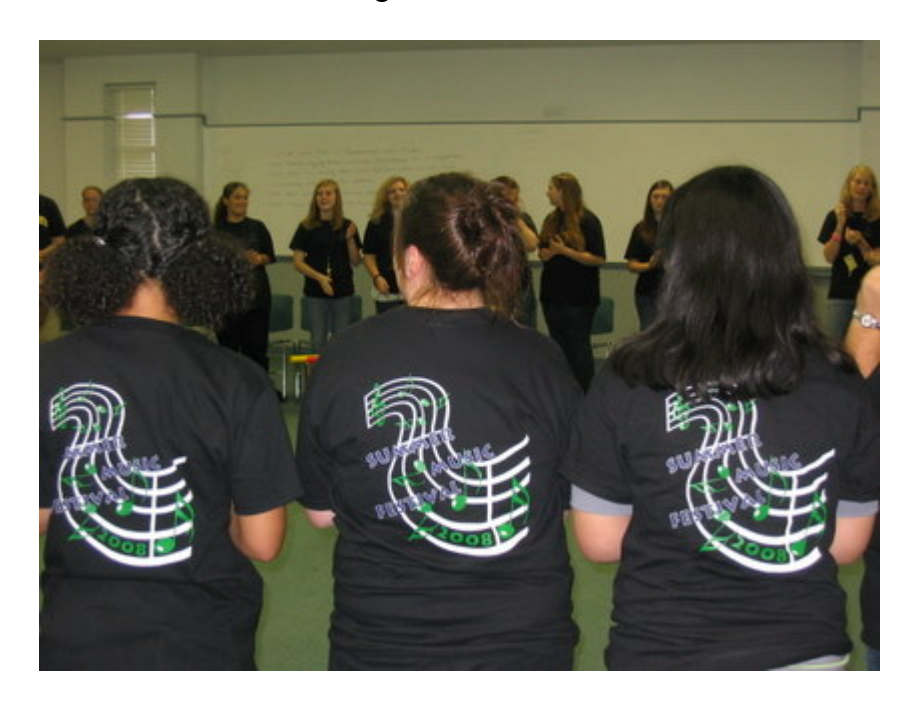
Drum Circle - We know our back is to you, but look at the Official 2008 Summer Music Festival shirt. Fantabulous! We took group and individual pictures after Drum Circle.