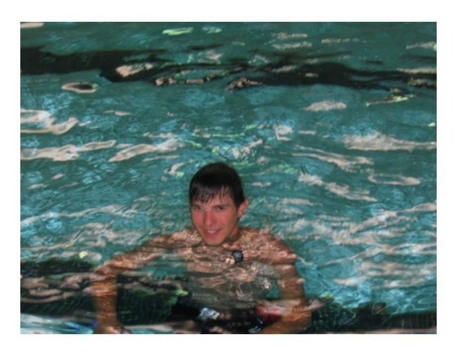
Some chose to go swimming.