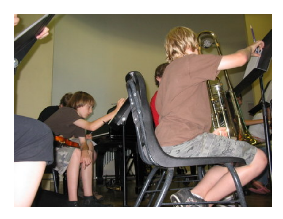
Elective - Improvisation - Writing scales. We have to know our scales in order to improvise.