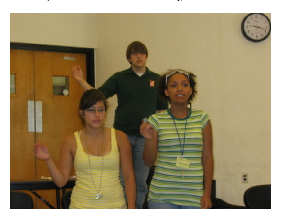
Elective - Conducting - We are learning the basics of music expression through the hands and batons.

Friday, June 6 - The weather was calmer. Everyone is settled into a routine. Tonight we have our pictures taken and it is Movie Night.