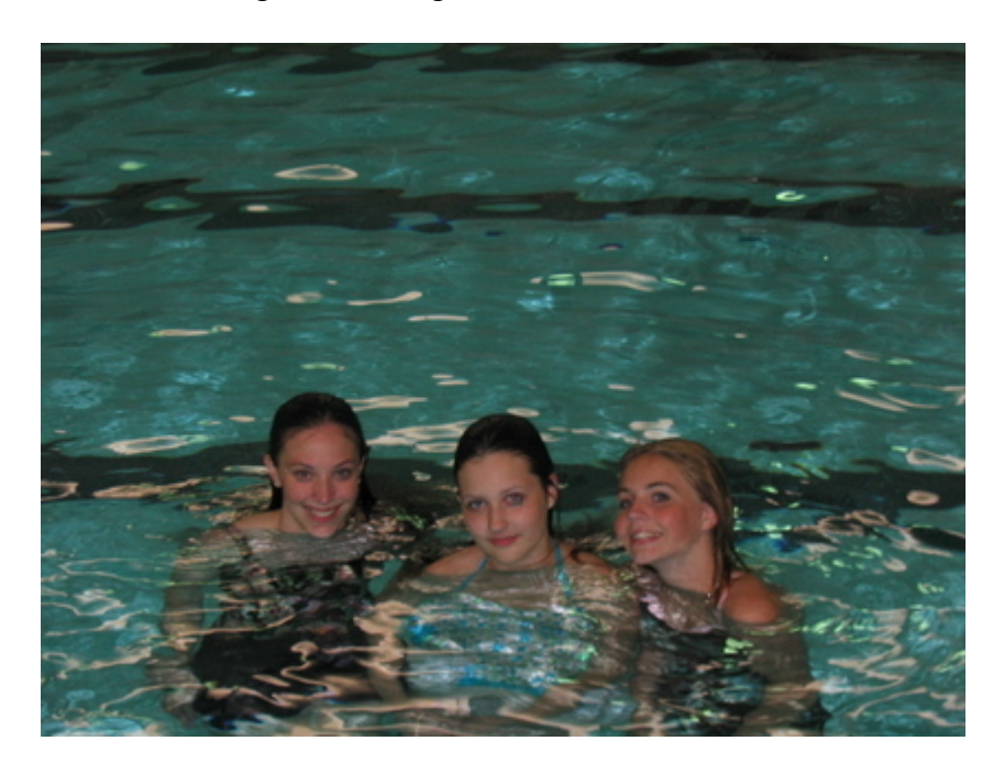
A great way to spend time with your festival friends.