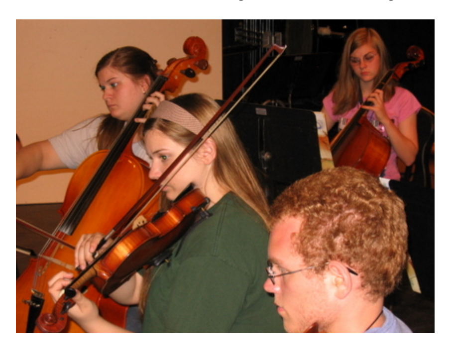
What can beat playing Mozart with festival friends on a warm summer day?