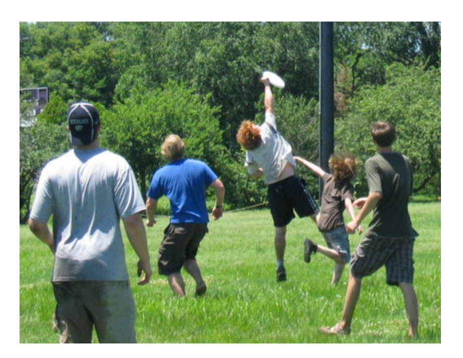
Got It! Yes Mom, we have laundry to do when we get home.