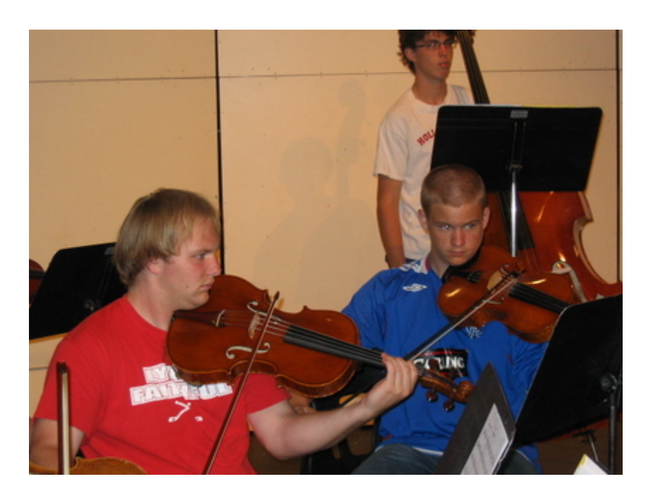
Counselors become colleagues in the rehearsal.