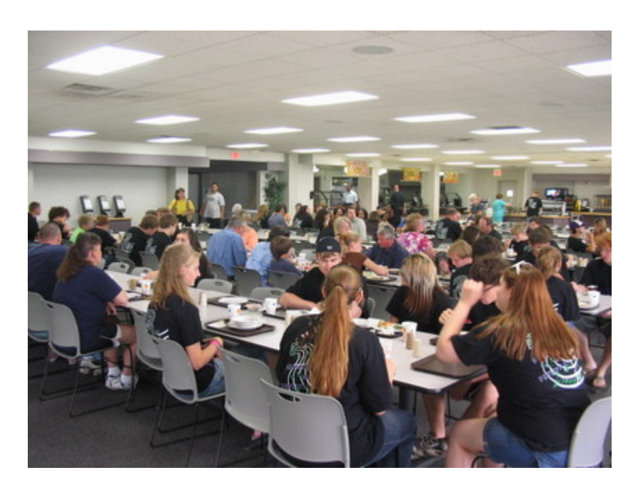
Banquet before the concert. We saw a montage of pictures of festitval activities.