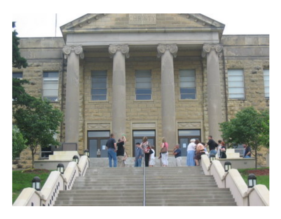
FAITH, HOPE, COURAGE and FREEDOM! Explaining the 4 pillars in front of Christy Hall. While participants were in dress rehearsal, Tim Shook conducted a campus walking tour for parents and family members.