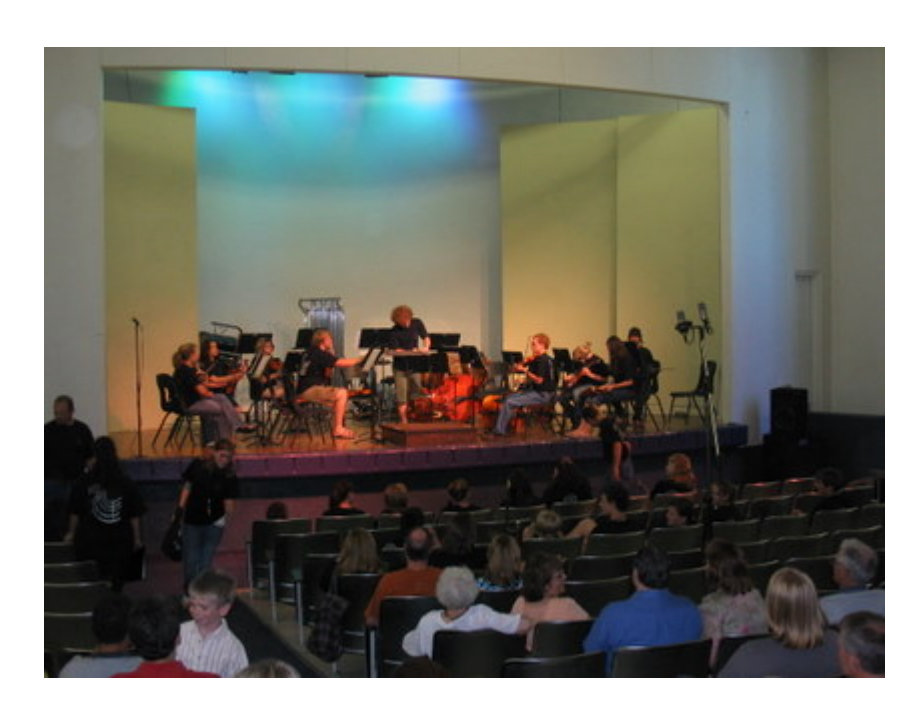
The orchestra prepared and ready to perform.