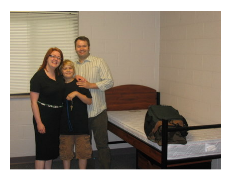
Reunion!! "I missed you Mom and Dad, and can I come back next year?!"