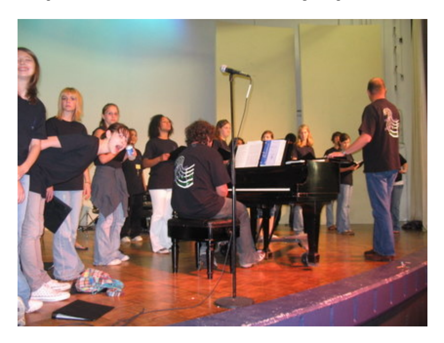
Dress rehearsal. Wearing our Festival T-Shirts.