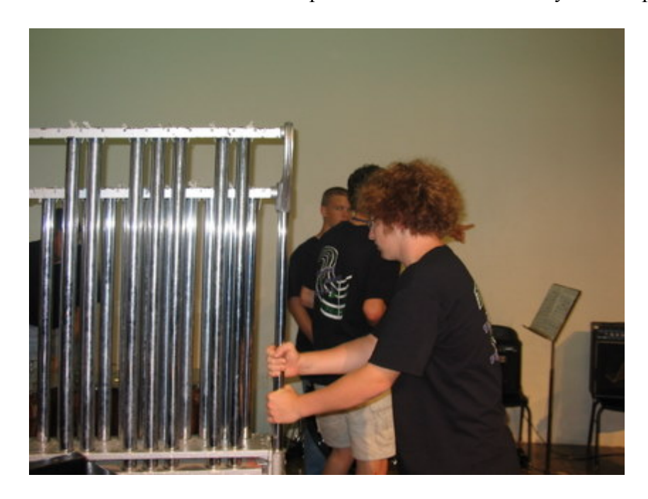
Moving percussion for the Festival Concert.

Walk down the historic "77 steps" and turn around. Always and impressive sight.