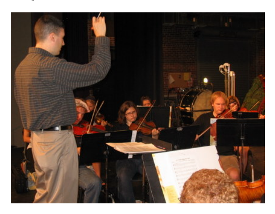
Last Rehearsal before the concert.