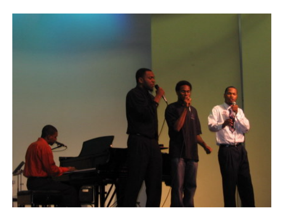
Roberts Brothers Gospel Quartet close the concert and bring down the house.