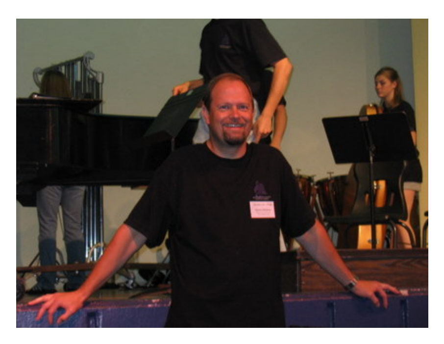
All rehearsed, time for performance.