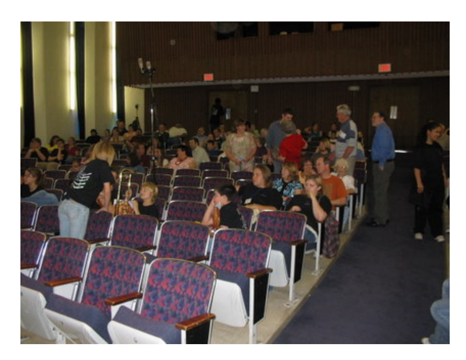
The buzz of anticipation begins. The house opens for the audience. Choose your seats fast, the hall will be full.