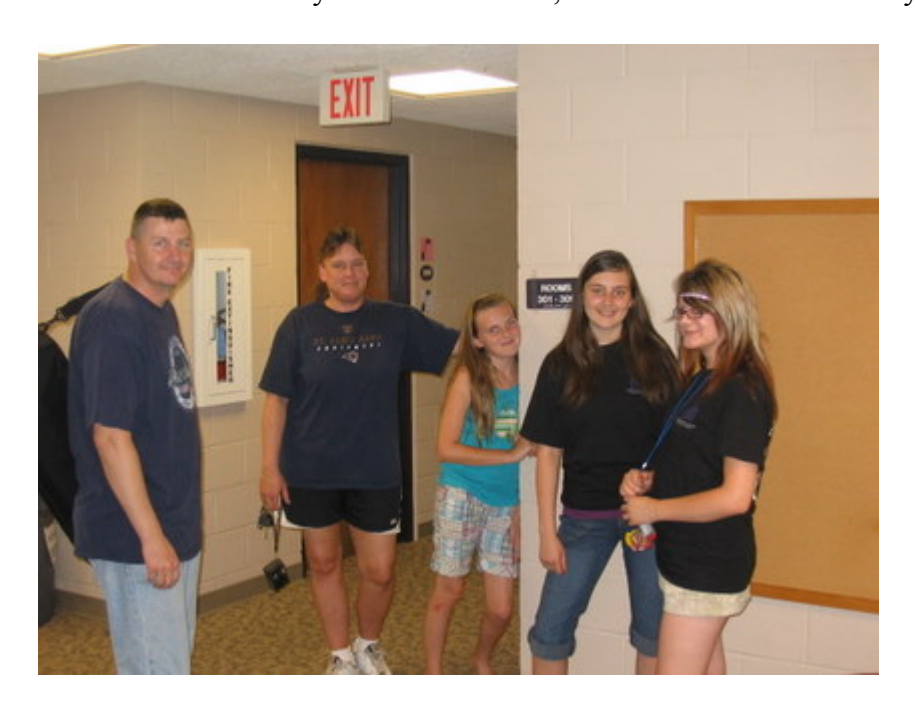
All packed, but don't want to leave my festival friends.