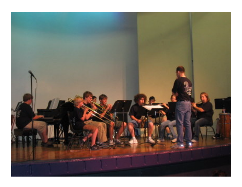
Jazz Band in concert. Every note worth listening to. They all improvised in solo. Amazing.