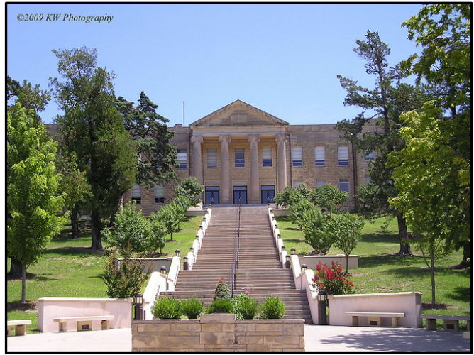
* Southwestern College Residential Campus Winfield, KS

Southwestern is a learning community of approximately 1,800 learners, 50 full-time teaching faculty members, and 270 affiliate faculty members from leading industries across the country. In addition to programs for traditional age learners and working adults, the College provides learning opportunities for service men and women in all branches of the military.